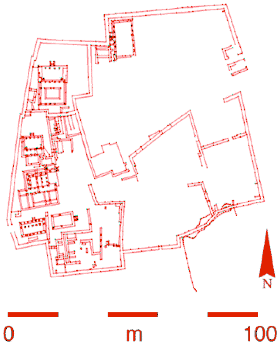
Fig. 3 Archaeos' mapping of the Noblemen's Quarter through February 2002.

Talwar, the Deputy Director of Museums and Antiquities of the State of Karnataka, Archaeos has also begun to three-dimensionally map an area of the Nobleman's Quarter, both as a comparison to the palace discovered by us on the North Ridge and in order to test the viability of three dimensionally rendering of other existing buildings at a future date (Figure 3).